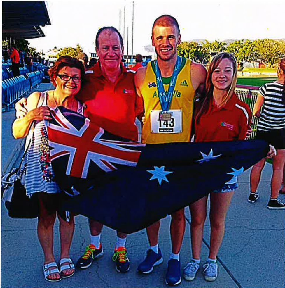
Crandell Family Oceania Championships 2015